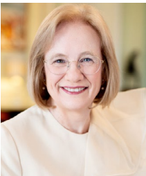
Her Excellency the Honourable Dr Jeannette Young AC PSM Governor of Queensland

Four years ago, Brisbane audiences were eagerly anticipating a season of Shanghai Ballet's The Lady of the Camellias .