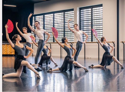
World-class studios and performance space