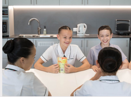
Light-filled common areas and student kitchen