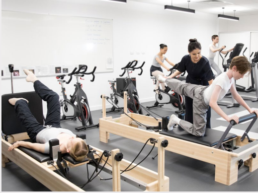
State-of-the-art fitness equipment